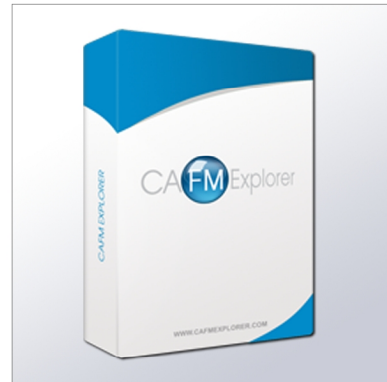
Easy Low Risk Startup

It's a great partnership from two organisations in the USA and UK that provide seamless expertise to a sector that has been crying out for a simple FM solution for years.