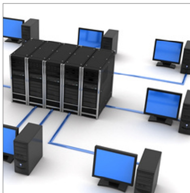
Scalability is crucial

"We now have an efficient and cost effective model to fast track the collection and building of data"