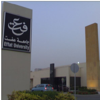
Effat University Jeddah

When EFFAT University sourced a CAFM Explorer system they wanted a product and service from a provider that matched their high standing values.