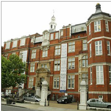
Royal Marsden London

In December 2010, the Estates Department at The Royal Marsden NHS Foundation Trust achieved ISO 9001 certification for its Chelsea site.